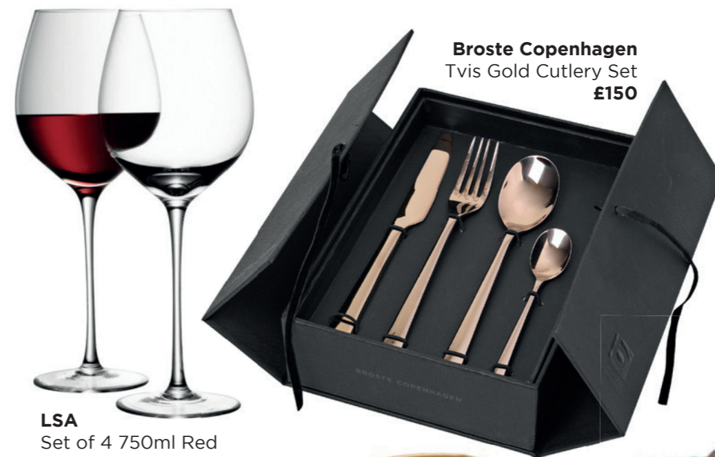
Broste Copenhagen Tvis Gold Cutlery Set £150

Add an elegant but festive touch to your Christmas dining table with an understated table runner in muted tones.