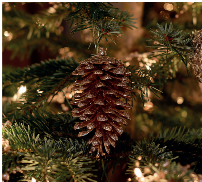
Bark & Blossom Golden Pine Cone £6