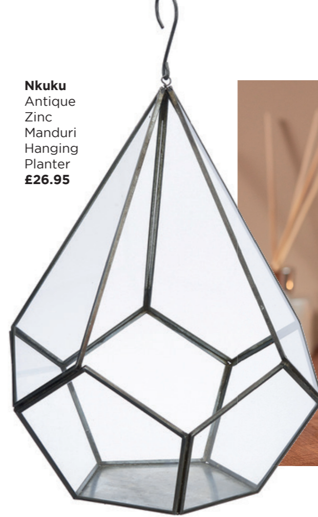
Nkuku Antique Zinc Manduri Hanging Planter £26.95