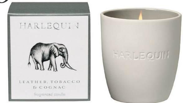
Harlequin Leather, Tobacco & Cognac £20