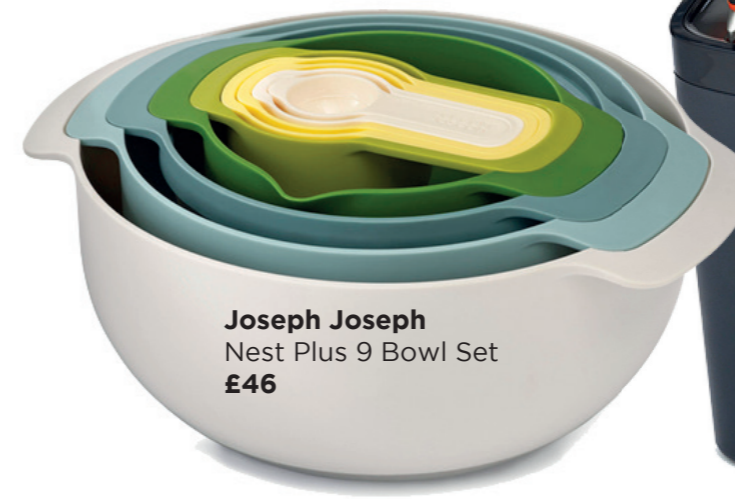
Joseph Joseph Nest Plus 9 Bowl Set £46