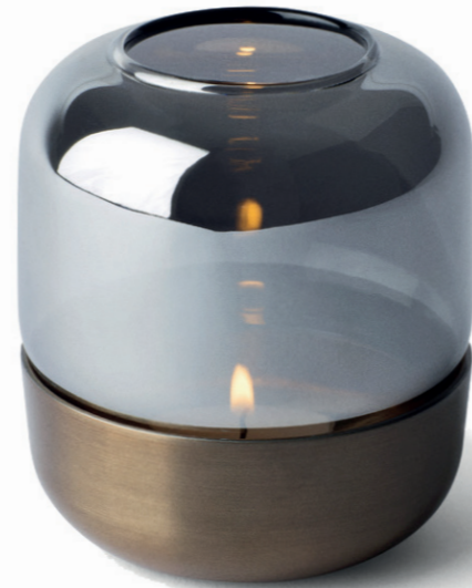
Menu Candle Holder £34.95