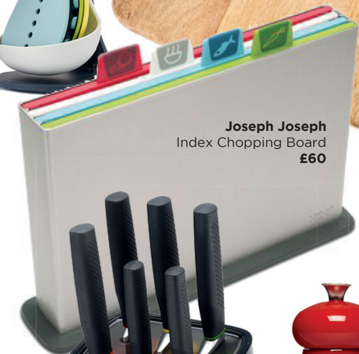
Joseph Joseph Index Chopping Board £60