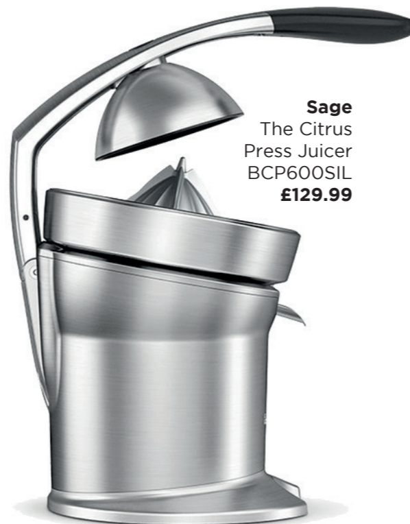
Sage The Citrus Press Juicer BCP600SIL £129.99

This Christmas, take your festive food preparation to the next level with a little help from Heston Blumenthal. The Sage by Heston Blumenthal range of kitchen appliances is stylish, innovative and easy to use - bringing a touch of class to any kitchen - and boasts chef-standard quality. From state of the art juicers and food processors, to cutting-edge kettles and coffee machines, transform your festive feast into something truly spectacular this holiday season.