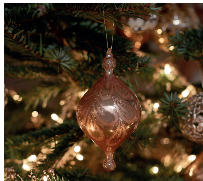
Bark & Blossom Onion Bauble £6