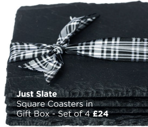
Just Slate Square Coasters in Gift Box - Set of 4 £24