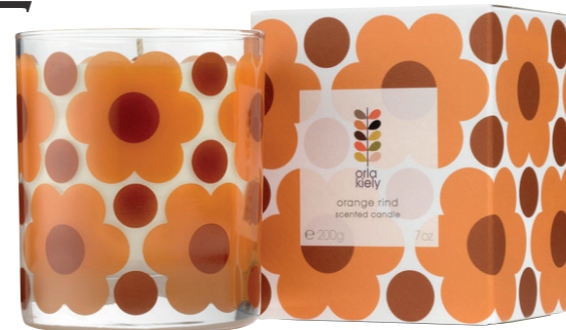
Orla Kiely Orange Scented Candle £25