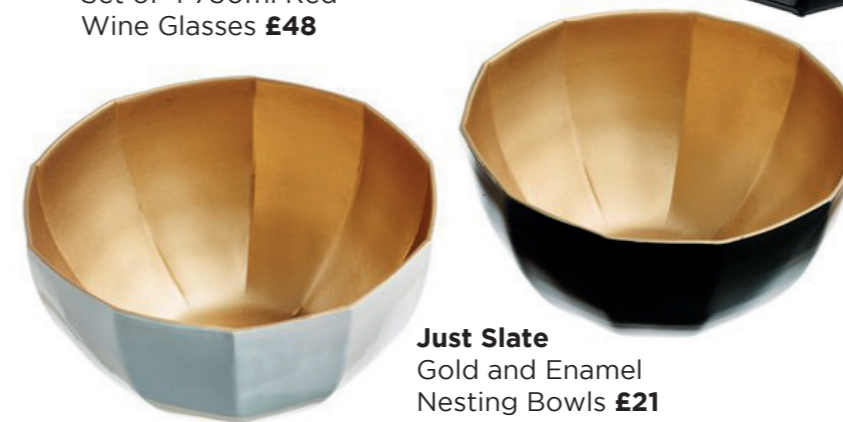
Just Slate Gold and Enamel Nesting Bowls £21