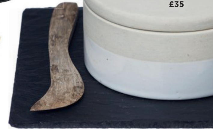
Just Slate Stoneware Gourmet Cheese Baker £35