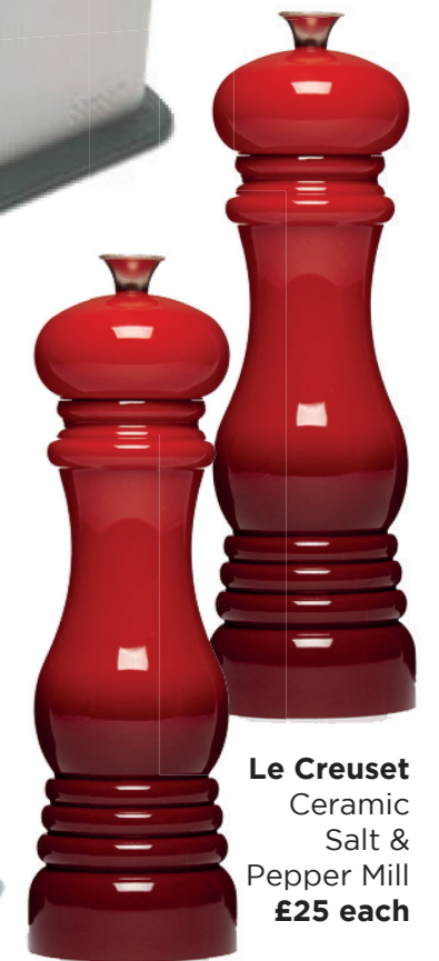
Le Creuset Ceramic Salt & Pepper Mill £25 each