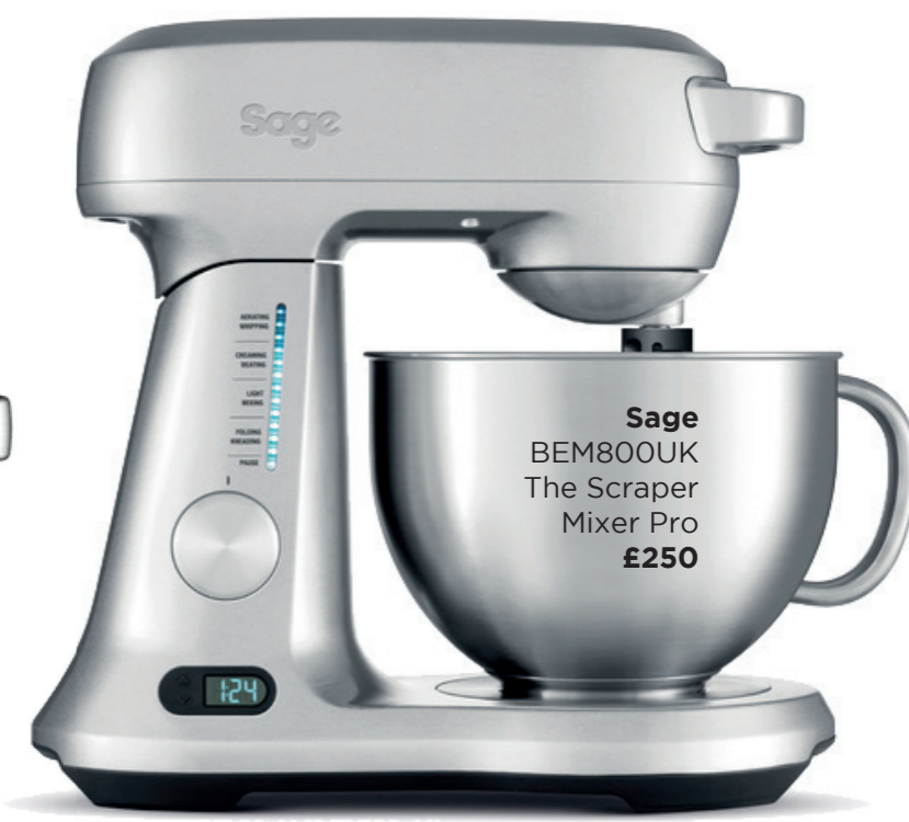
Sage BEM800UK The Scraper Mixer Pro £250