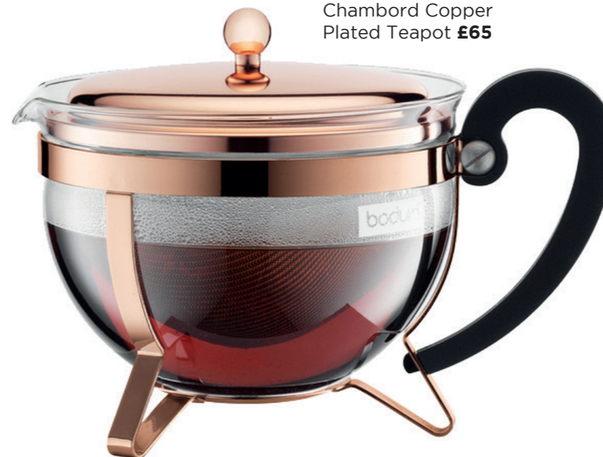
Bodum Chambord Copper Plated Teapot £65