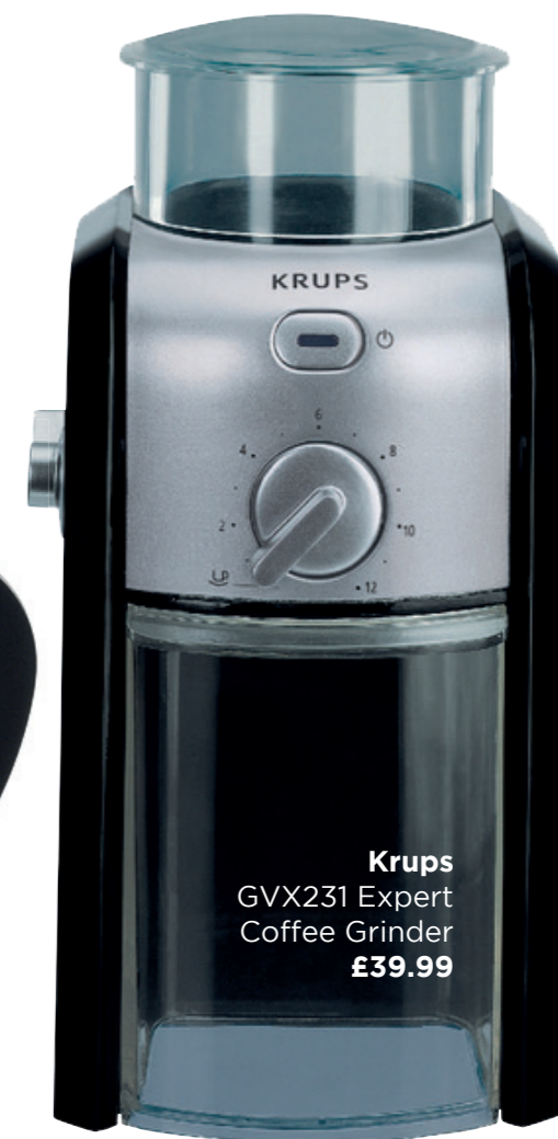
Krups GVX231 Expert Coffee Grinder £39.99