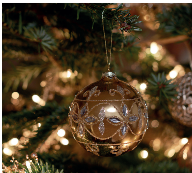
Bark & Blossom Gold Glitter Flower Bauble £4