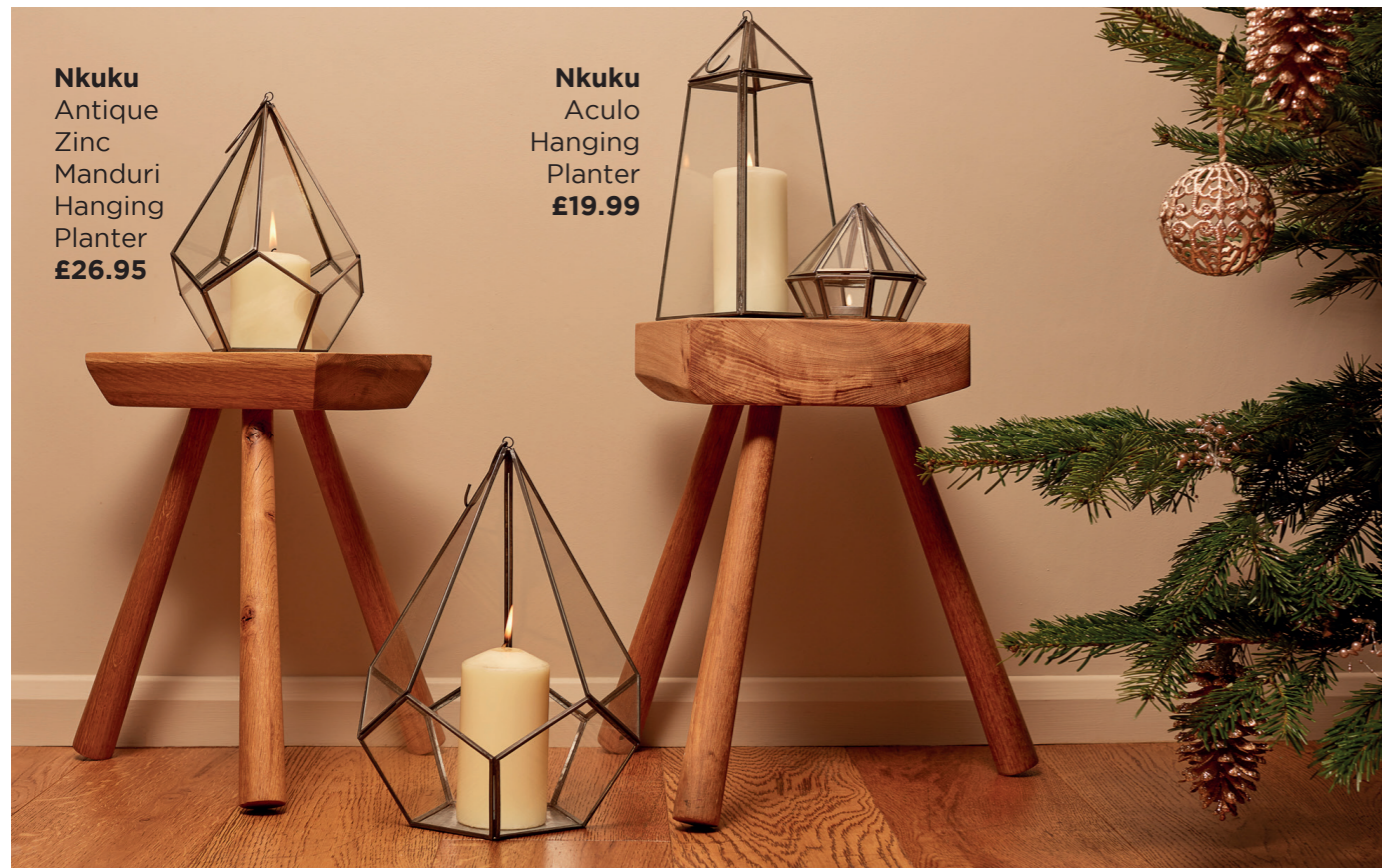
Nkuku Antique Zinc Manduri Hanging Planter £26.95