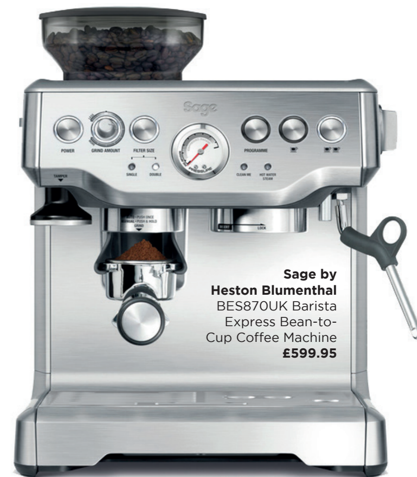
Sage by Heston Blumenthal BES870UK Barista Express Bean-to-Cup Coffee Machine £599.95

Coffee machines and cafetières are today a permanent fixture in the kitchen and offer an additional opportunity to furnish your living space with contemporary metallic accents. Whether for yourself or as a gift for a friend or family member, show off your fine taste with our new coffeeware highlights from industry-leading brands including Bodum, Sage and De'Longhi.