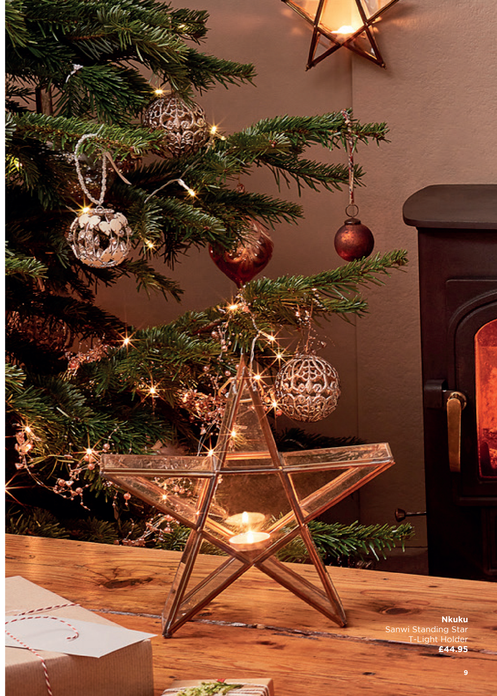
Nkuku Sanwi Standing Star T-Light Holder £44.95