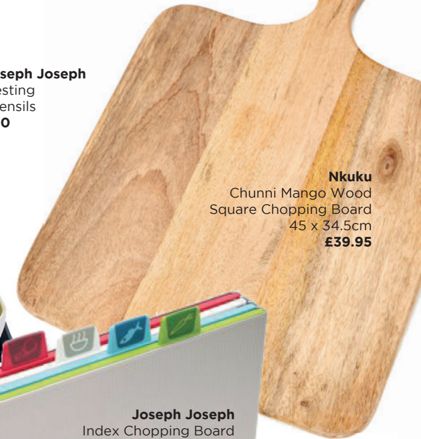
Nkuku Chunni Mango Wood Square Chopping Board 45 x 34.5cm £39.95