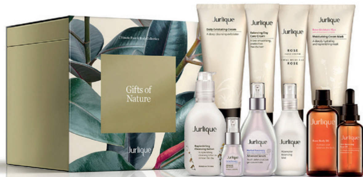
Jurlique The Ultimate Face & Body Collection £280