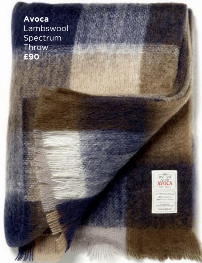
Avoca Lambswool Spectrum Throw £90