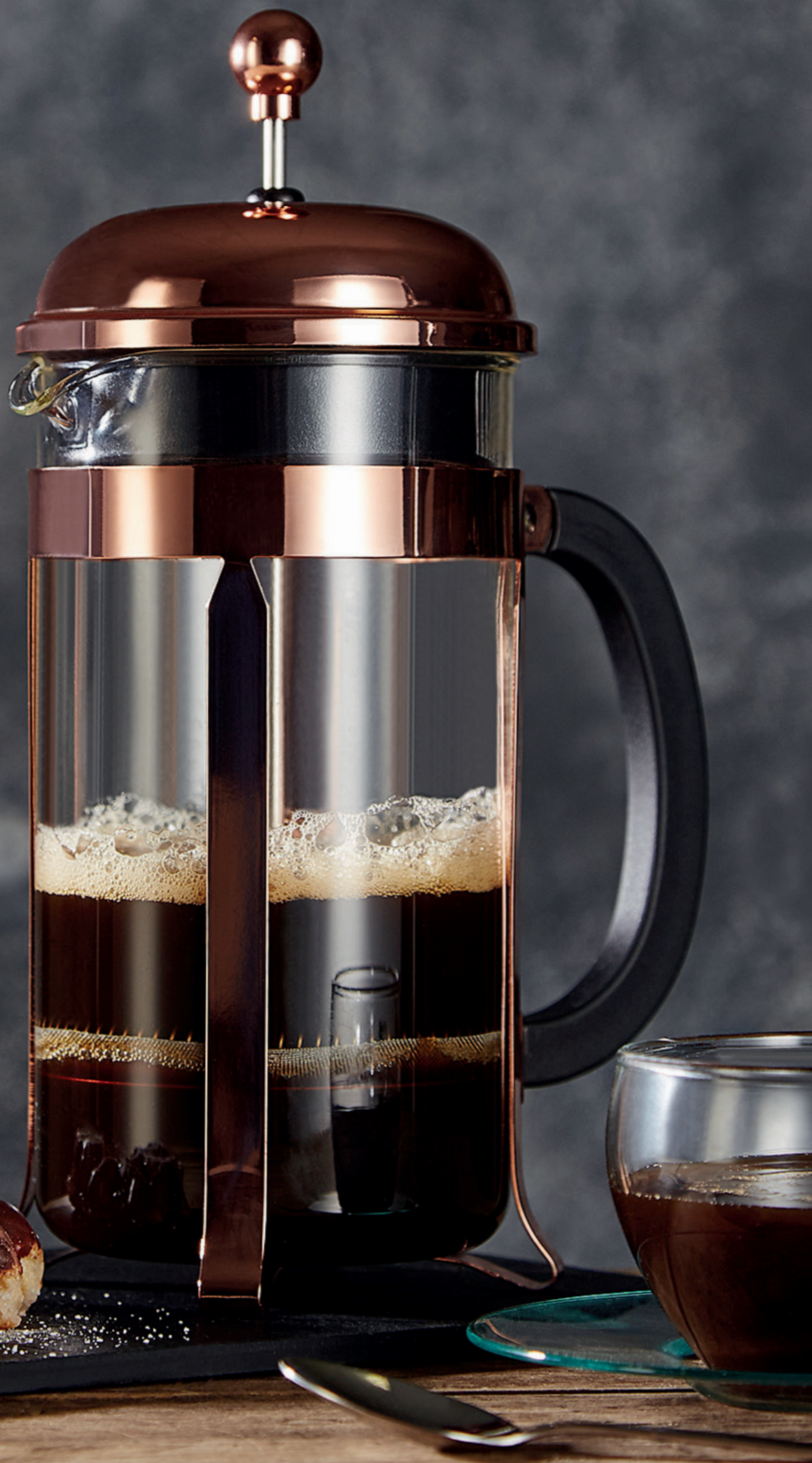
Bodum Chambord 8 Cup Coffee Maker £39