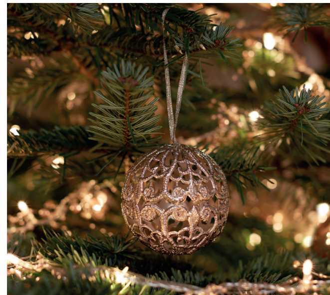
Bark & Blossom Gold Lace Bauble £4