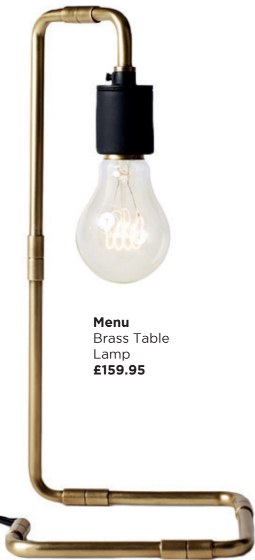
Menu Brass Table Lamp £159.95

Home accessories and lighting arguably offer the easiest way to introduce a warm, cosy and hygge atmosphere into your home this Christmas. Whether it be soft flickering candlelight in the corners of your living room or a finely crafted vase with subtly scented flowers, add a sense of soothing calm into your home with The Hut's collection of home accessories and lighting.