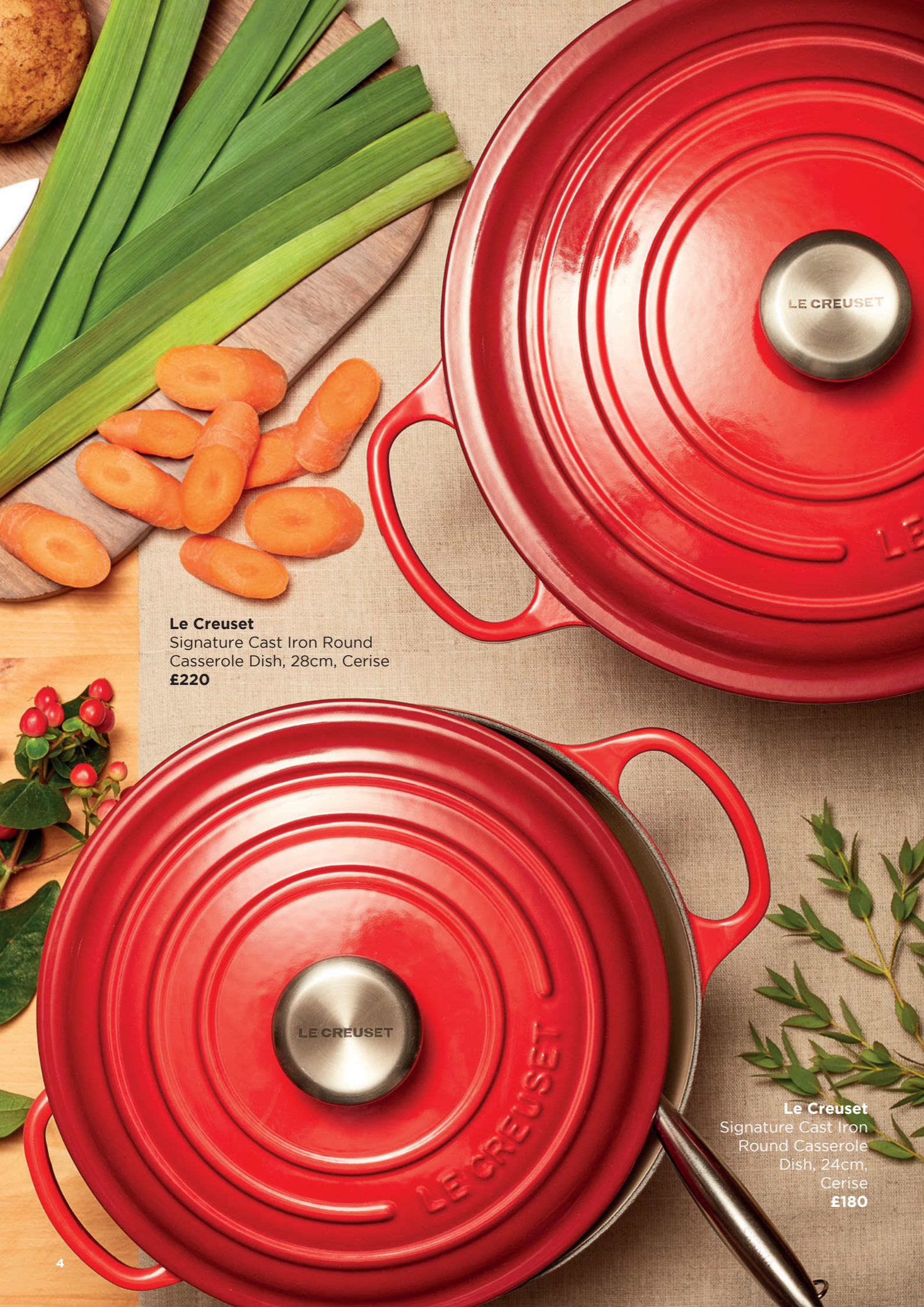
Le Creuset Signature Cast Iron Round Casserole Dish, 28cm, Cerise £220

Often the focal point of your day, your Christmas dinner will be the most important meal you eat this year. The rare chance to dine with your family and friends on such a special occasion makes your Christmas dinner a memorable occasion , and so you will want to ensure this year's dinner is nothing short of perfection. From the mouth-watering texture of the turkey and fluffy roast potatoes to the bang of your Christmas crackers and the tang of your post-dinner cheese board, The Hut's kitchenware collection includes everything your kitchen needs to be Christmas-ready this festive season .