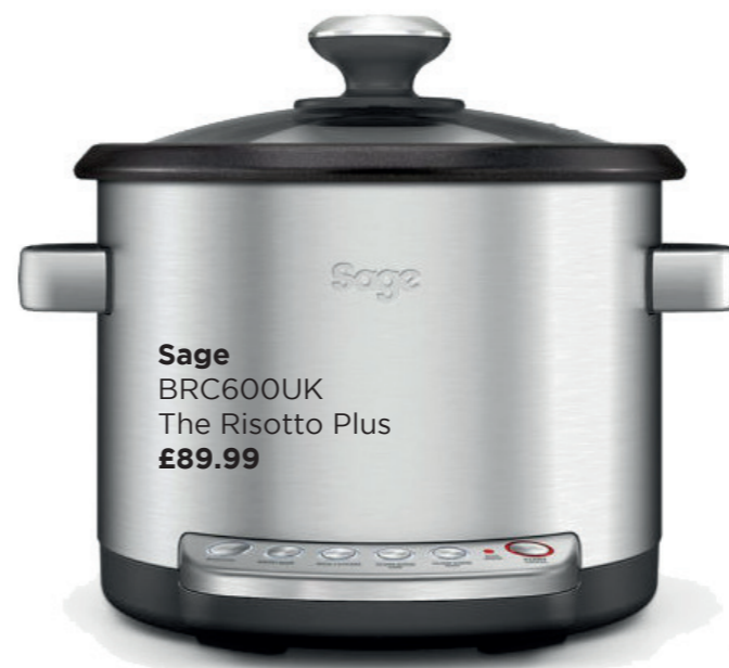
Sage BRC600UK The Risotto Plus £89.99