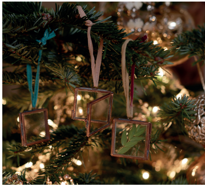
Nkuku Tiny Kiko Frame Set of 4 £16.95

Whether you opt for Scandinavian-inspired minimalism, or on-trend copper and marble accents, inject some opulence into your home this season with our collection of beautiful decorations.