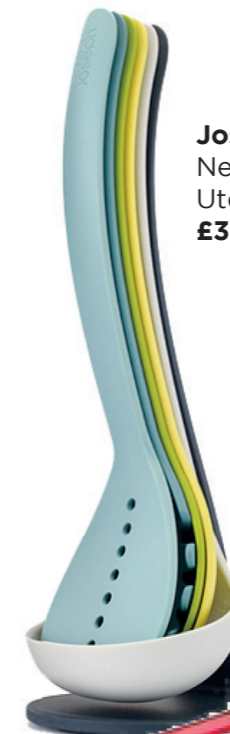
Joseph Joseph Nesting Utensils £30