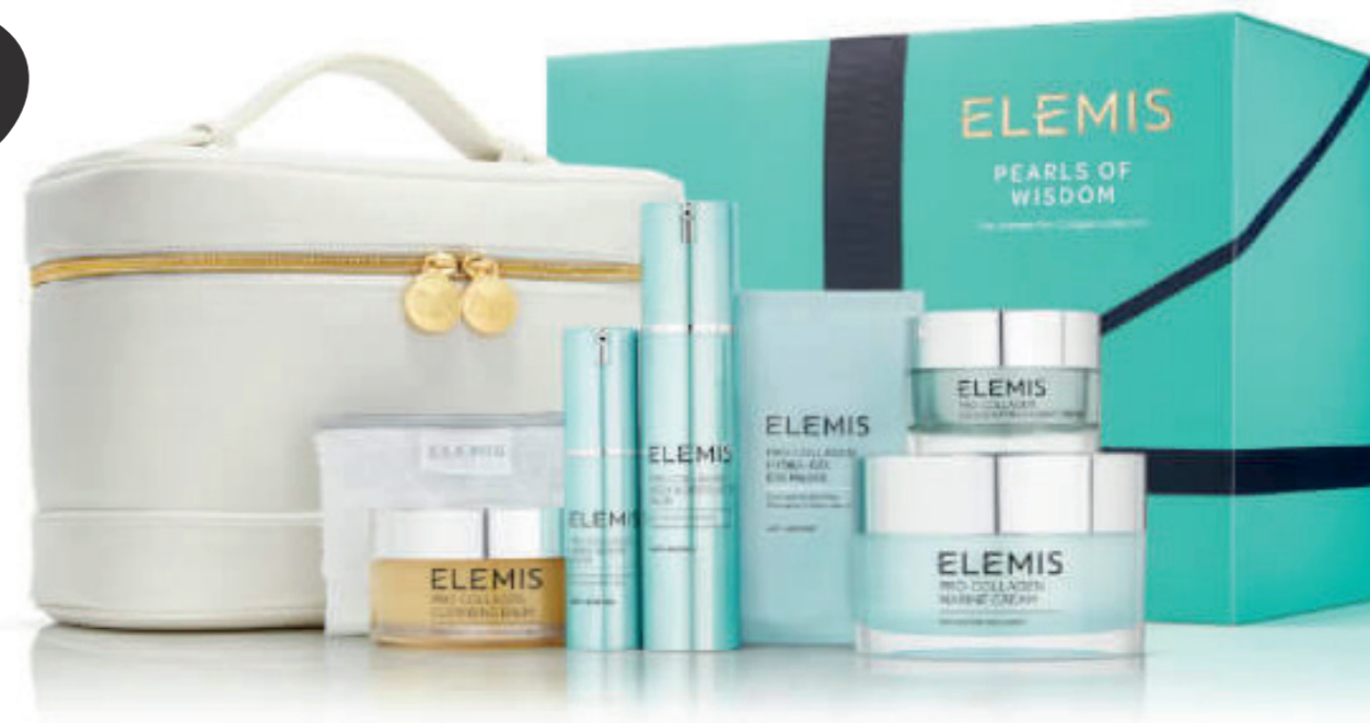
Elemis Pearls of Wisdom Collection £199