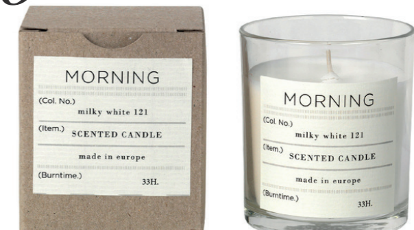
Broste Copenhagen Scented Candle £8.50