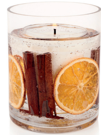
Stoneglow Cinnamon & Orange £22