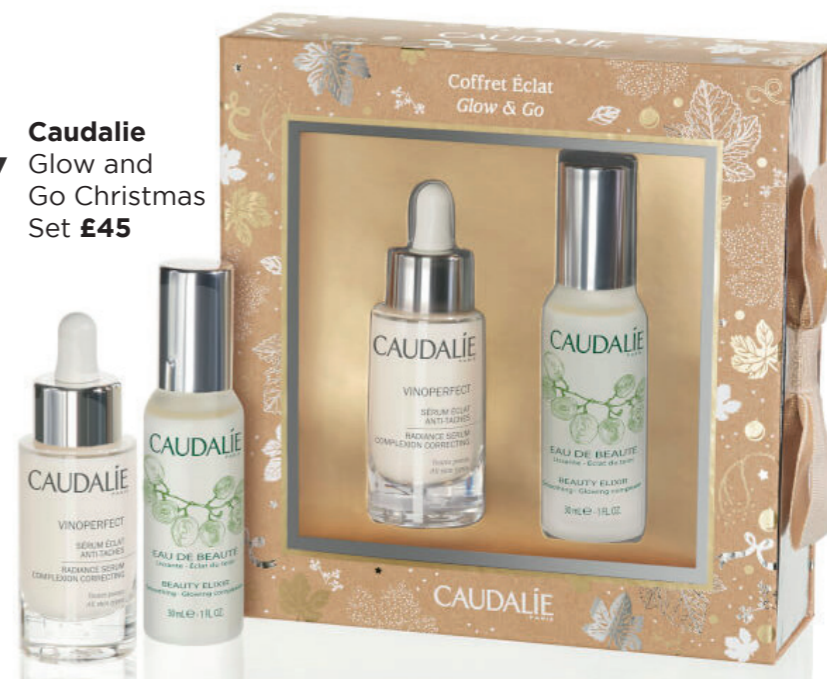
Caudalie Glow and Go Christmas Set £45