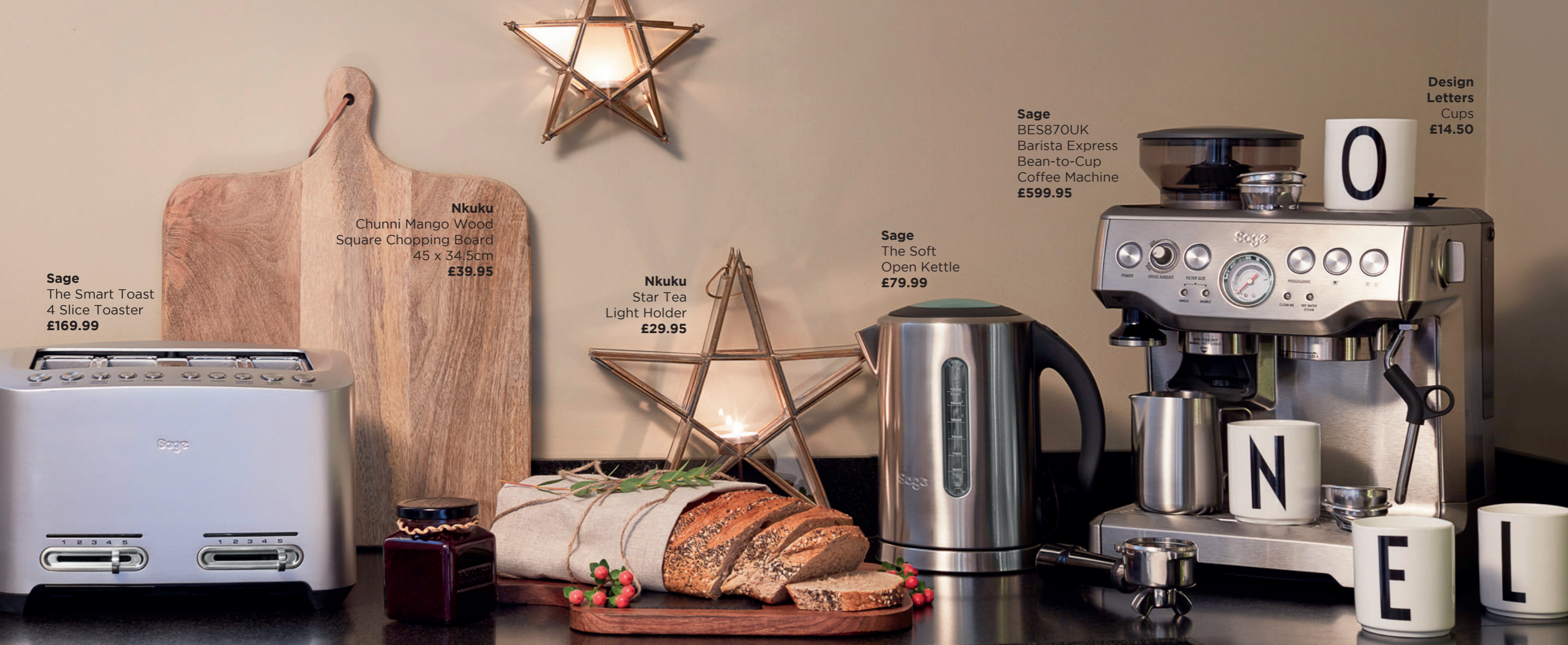
Sage The Smart Toast 4 Slice Toaster £169.99