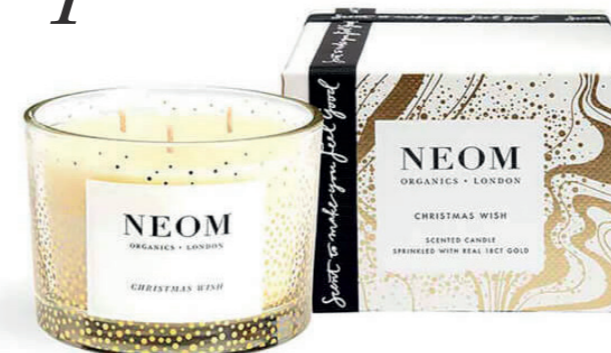
Neom Organics Christmas Wish Candle £45