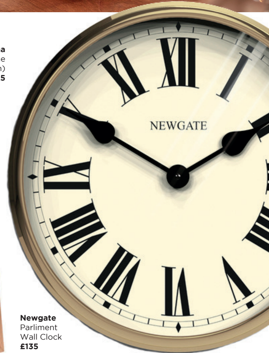
Newgate Parliament Wall Clock £135