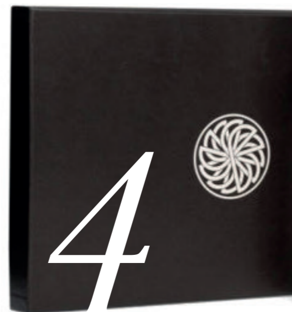
The Gentlemen's Tonic Ultimate Gift Set £210