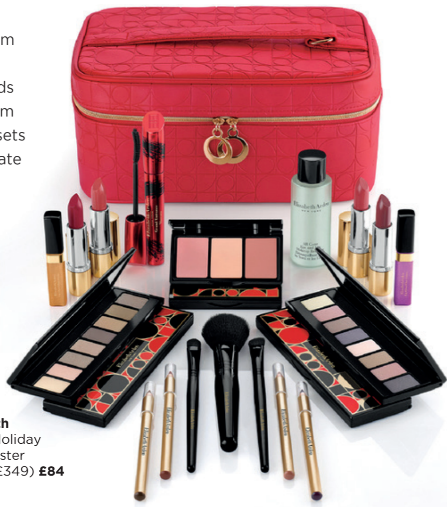
Elizabeth Arden Holiday Blockbuster (worth £349) £84