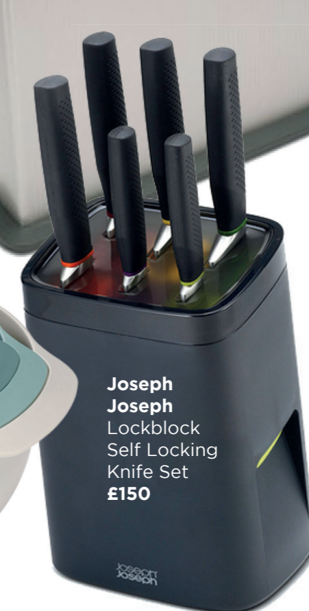
Joseph Joseph Lockblock Self Locking Knife Set £150